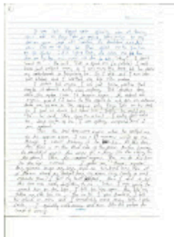
Page1 Victim 1 .jpg 521K